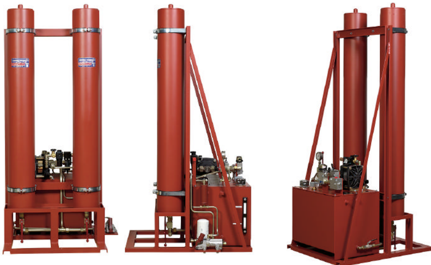
APS starting system (Variation B) with all components mounted on a frame. Two accumulators per system, each with a shut off valve. Complete system ground painted.