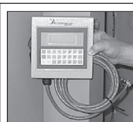
Remote Hand Held Controller